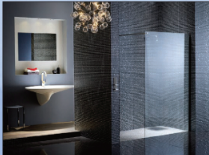
1000mm single panel shower screen

This range is characterised with a square signature design large panels of frameless glass that show off your bathrooms tiles and features beautifully. Each screen comes with Clearshield easy to clean glass as standard. A quick rinse is all that is required to keep the glass sparkling and good as new.