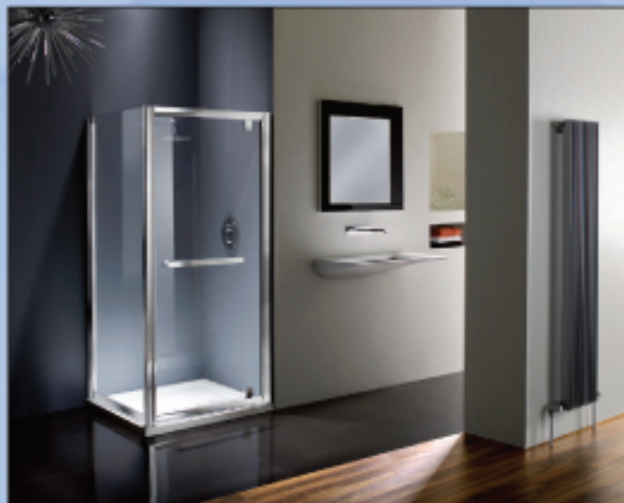
NaMara pivot door and frameless side panel

Namara is a modern collection of semi frameless shower doors with clearshield glass as standard. This patented easy clean surface coating repels everyday dirt and lime scale to keep shower doors sparkling clean with a simple rinse, saving valuable time and effort. In tune with today's busy lifestyles and demands for high performance and design, the NaMara range recognises low maintenance as being equally important as style and quality. For more information on these great ranges and more from Flair please visit their website on www.flairinternation.com