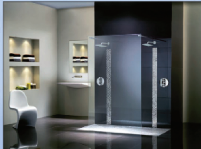
Double entry 1200mm shower screen

Namara is a modern collection of semi frameless shower doors with clearshield glass as standard. This patented easy clean surface coating repels everyday dirt and lime scale to keep shower doors sparkling clean with a simple rinse, saving valuable time and effort. In tune with today's busy lifestyles and demands for high performance and design, the NaMara range recognises low maintenance as being equally important as style and quality. For more information on these great ranges and more from Flair please visit their website on www.flairinternation.com